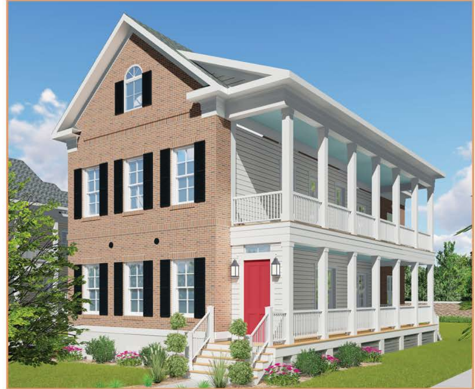
OPTIONAL BRICK EXTERIOR