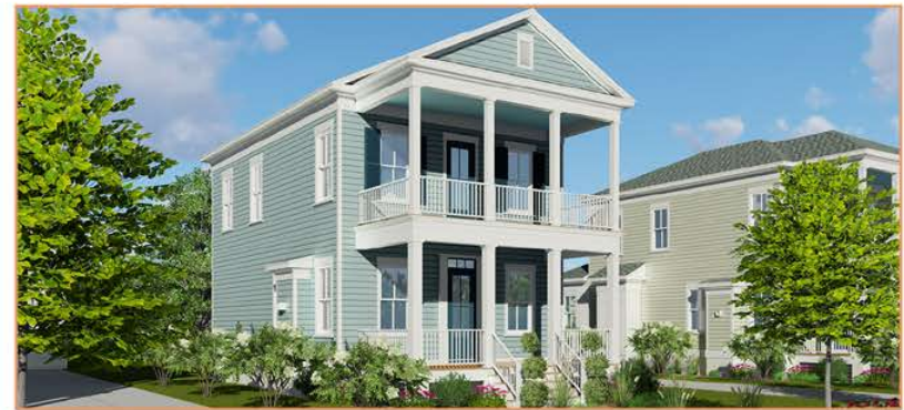
OPTIONAL SECOND FLOOR PORCH