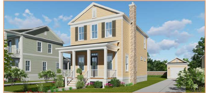
OPTIONAL BRICK FIREPLACE